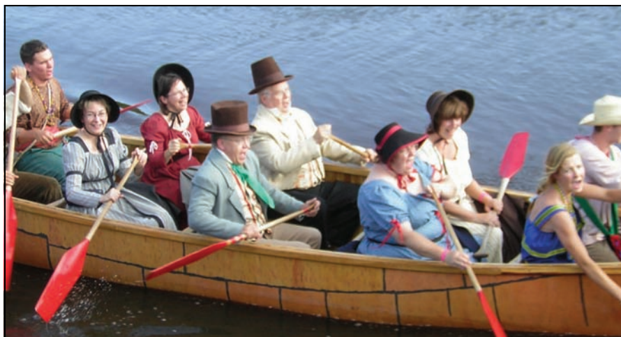
Executive arriving to Federation Dinner Thunder Bay 2006