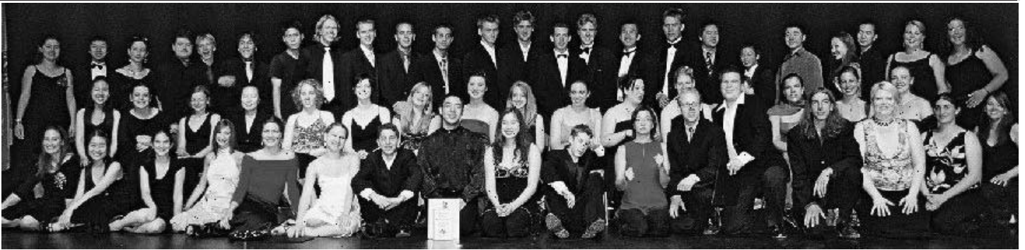
Congratulations to all National Finalists - photo taken at the Sagebrush Theatre, Kamloops BC, 2005